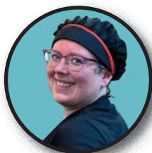
Food Service Director Wisconsin Camp Meeting