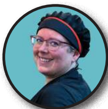
Food Service Director Wisconsin Camp Meeting