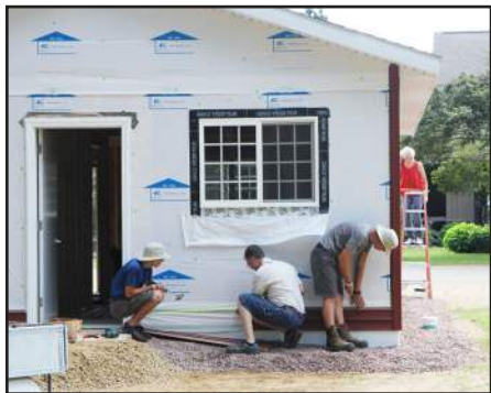
The final push in finishing the new Medical Building! Thank you to all our donors, volunteers and prayer warriors!