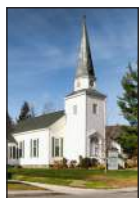
Town Hall Meeting President, Treasurer, Trust, Ministerial, Education, Youth, Communication Sunday 2:30 pm