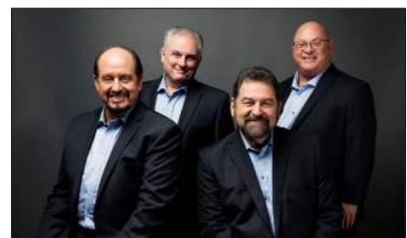
The King's Heralds Quartet This male singing group, founded in 1927, is the oldest continuous gospel quartet in America.