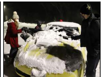
After a big snowstorm, students clear snow and ice from vehicles at Prairie Ridge Health, the local hospital in Columbus. Over 20 students and staff surprised hospital employees and visitors with this unexpected act of kindness, which was much appreciated by the vehicle owners we met.