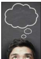
Ask Your Leaders President, Treasurer, Trust, Ministerial, Education, Youth, Communication