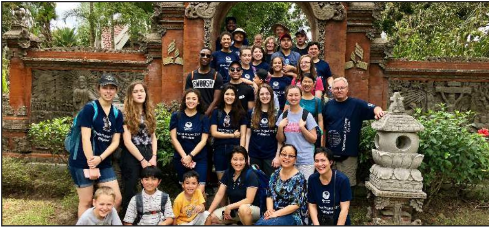
Our team of 32 students, staff, and friends spent 17 days on WA's second project in the Philippines.