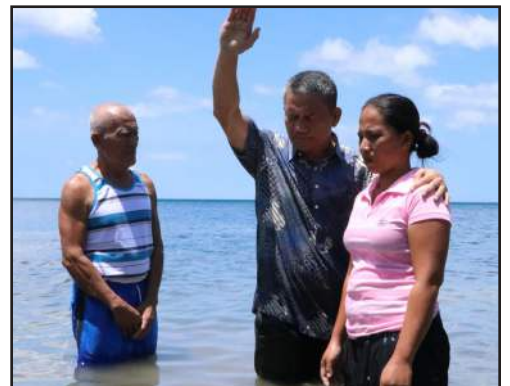
A new believer gives her life to Christ through baptism. Nineteen people were baptized while we were there, and more are preparing.