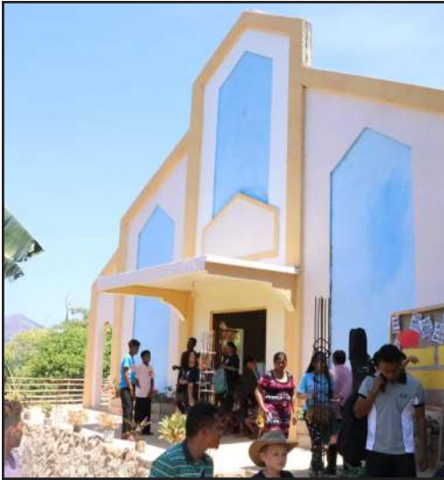
The church we built two years ago in Marcillia as it stands today. Our group took part in the dedication of this beautiful house of worship.