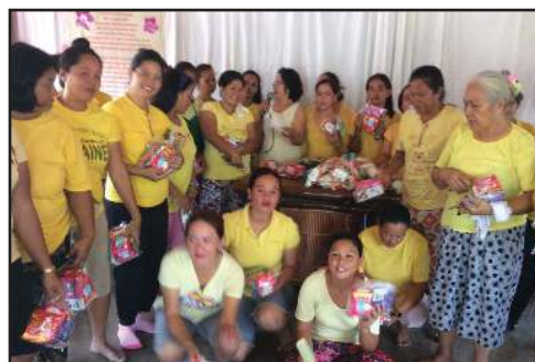
Students' ongoing Sabbath School offerings fund combs, toothpaste, and other basic needs for these and other prisoners.

Through the self-sacrifice of dedicated lay persons, each of these prisons has a Seventh-day Adventist congregation meeting on a weekly basis. Lack of seating forces most prisoners to sit on the floor. The students decided to begin collecting a Sabbath school offering each week, and two other people volunteered to match the students' gifts. The