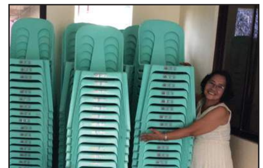
A special Sabbath School offering made these chairs possible for a small Seventh-day Adventist church in a prison.