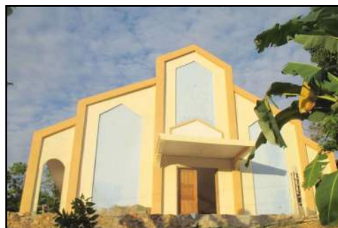
The church we built two years ago in Marcilla hosts a thriving congregation of Adventist believers.

Two years have passed. With the local labor of church members and funding from the money the students raised, the church is now completed and the time has come to prepare for our return.