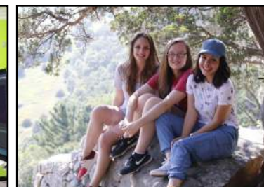
Students enjoy the view from a rocky perch at Gibraltar Rock State Park on a Sabbath afternoon. After Sabbath lunch supper and heading out to enjoy God's creation at places like Kohler-Andrae State Park, Point Beach State Natural Area, and Horicon Marsh.