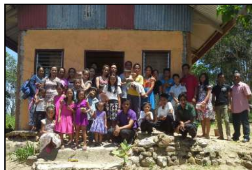
The Adventist congregation in Bonongan wait for a permanent structure that will meet their needs.