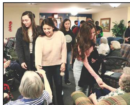
Students interact with residents at an assisted living center. This winter, we have spent several Sabbath afternoons singing and visiting at nearby hospitals, nursing homes, and centers.