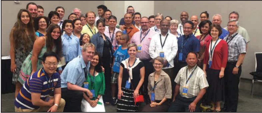
Wisconsin Conference pastors, families and office staff who attended either or both the ministerial meetings in Austin, and the General Conference Session in San Antonio, Texas.

Over 4,300 pastors and their families from across North America converged on Austin, TX, for the first ever North American Division Ministerium meetings on June 28.