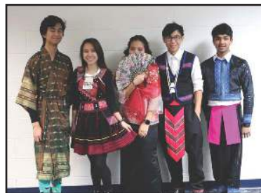
Students represented their cultural heritage on Monday of Spirit Week. Other daily themes included: Sports Team Wear, Crazy Hair/Hats, Historical Characters, Twins, and "Guacamole".