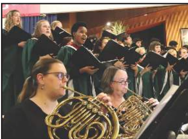
Over 400 family members and friends attended our Christmas Concert featuring over sixty student singers, bell-ringers, and instrumentalists, joined by forty community orchestra members.