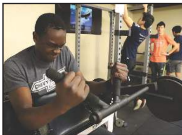
Four mornings each week, for the last five years, students have begun the day with a 7 am personal fitness routine. Exercise helps students be better prepared to achieve in every area of life.