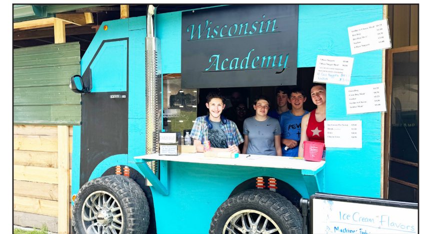
WA Seniors are waiting to take your order at the Snack Shack!