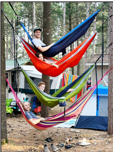
Just Hangin' Out