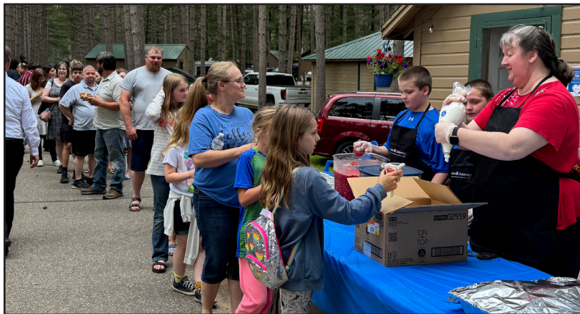
Did you see the line for Strawberry Shortcake? Thank You AU Alumni!!