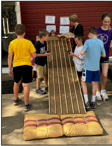
Lego Races at the Little Red Schoolhouse