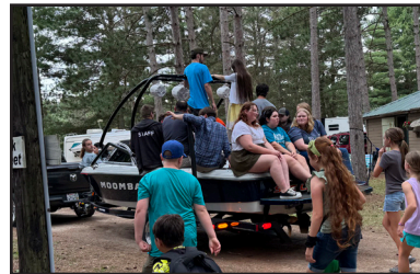
Summer Camp staff riding the boat and inviting kids to come to camp

Radio Station for Camp Tune in to 87.9 FM to hear broadcasts of the programming in Pioneer Pavilion during camp meeting.