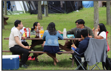
Sharing Sabbath Lunch