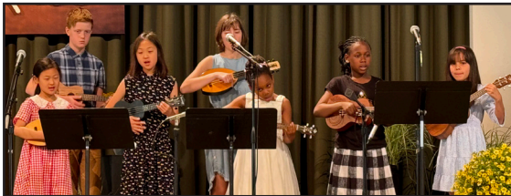
Students from Milwaukee sharing their musical gifts!