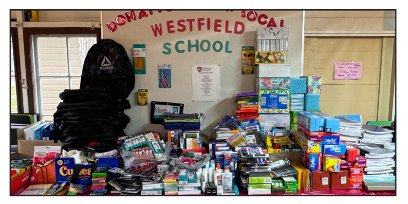
Together we collected 4,396 items for the Westfield Schools! Thank You! Thank You! Thank You!

Next year's ACS collection will be non-perishable food items.