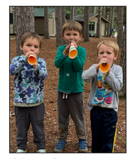
Did you hear Gideon's Army marching through camp yesterday?