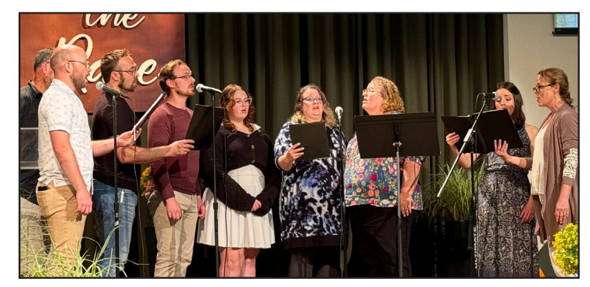
The Lawson family sharing their gift of music: "God is Coming, Are You Ready?"