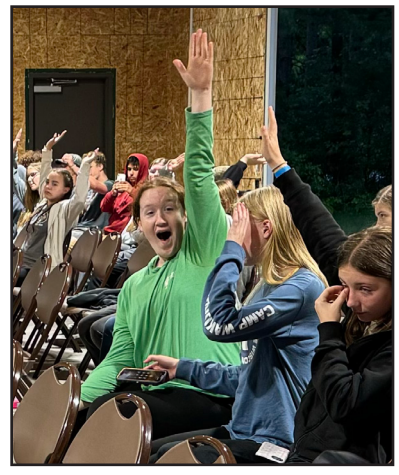
Excitement in the Teen Division

Planning to Deliver a Camper Next Year? Please notify Reservations Office so we can direct the delivery driver to the correct site. Send notice to campmeeting@wi.adventist.org or call 920-484-6555 x 316.