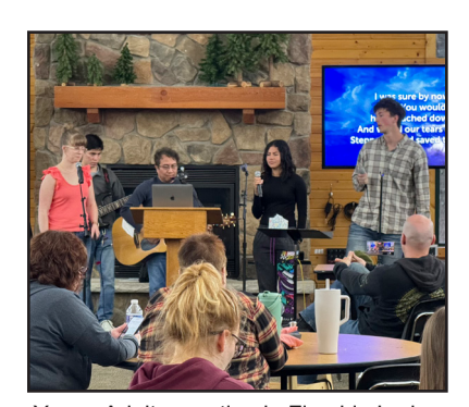
Young Adults meeting in Fireside Lodge