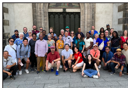
Tour group in front of door where Luther nailed the 95 thesis

O n Sunday, September 17, a group of 58 pastors, conference workers, family members, and friends embarked on a memorable journey following in the footsteps of the early reformers.