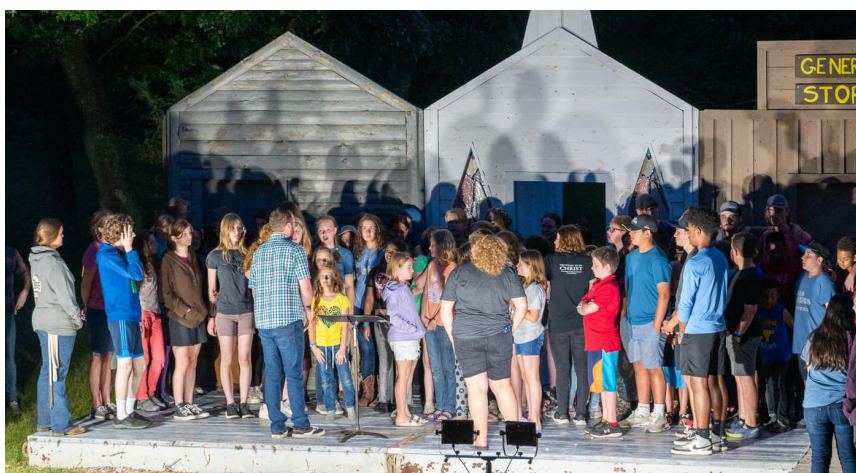
Campers and staff respond to God's call to commit their lives to Him.

Finally, during camp meeting, he remembers talking with a friend who said that she had a dream that the Latter Rain was going to be falling soon, or maybe even had begun to fall at this very time.