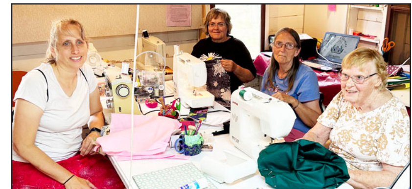
Making Walker Bags in the Adventist Community Services Cabin