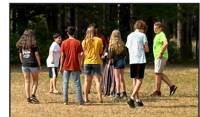
Teen Division playing Capture the Flag

Require that cabins are not packed so full of stored items that others cannot enter or use them. NO ITEMS MAY BE LEFT UNDER A CABIN. Violation of these regulations may cause Camp Wakonda to be subject to license suspension and/or fines which may be passed on to the individual renter.