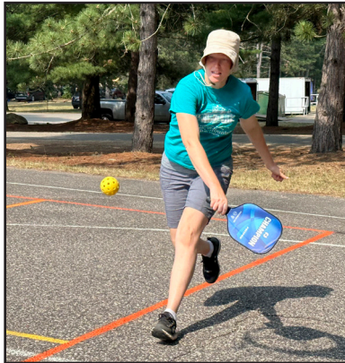
Fun on the Pickleball court