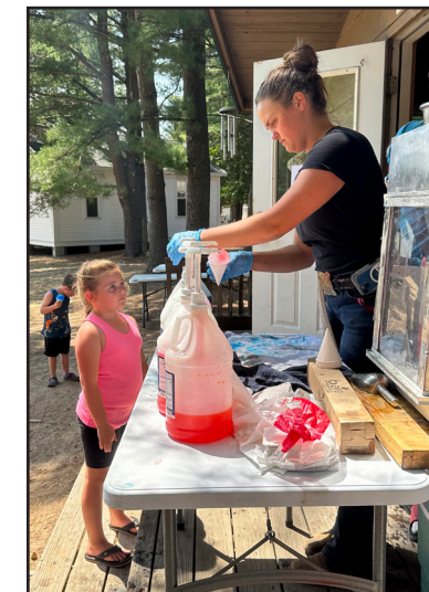
I'm ready to cool off with a snow cone!