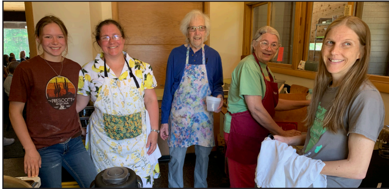
Thank you to all the helpers in the Cooking/Microgreens Class! We couldn't have done it without you!