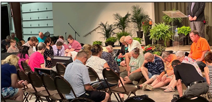
Many came forward in response to the call to intentionally mentor the next generation