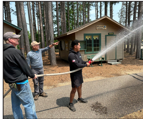
"Put out the Fire!!" Testing Fire Equipment during the practice drill