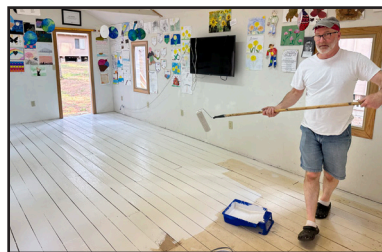
The Little Red Schoolhouse floor getting an update