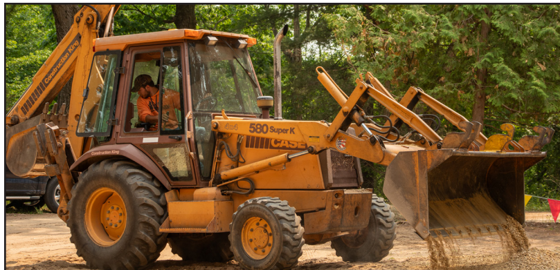
Making sure everything is ready to go