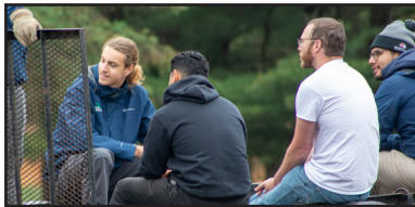
Pastors and staff having fun on the tractor during camp pitch