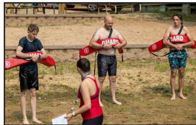
Lifeguard Training at Sandow Lake

Hallelujah Hustle 5K Run/Walk 7:30 am, Sunday at the ball field. Registration in front of Book Store: Friday 3-6 pm and Saturday night after the evening meeting.