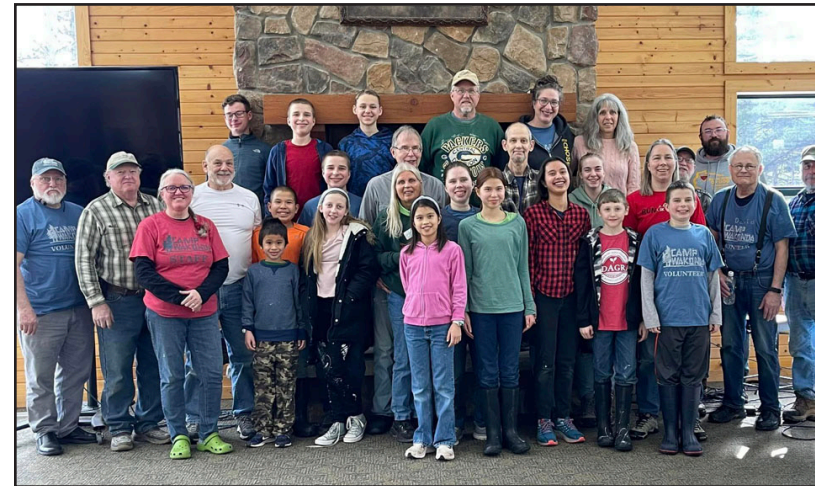
One of the many volunteer groups that have given of their time

If you are reading this it's likely because you are here at Camp Wakonda looking forward to this wonderful camp meeting week!