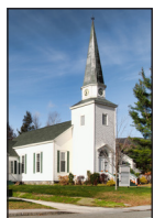
Town Hall Meeting President, Treasurer, Trust, Ministerial, Education, Youth, Communication Sunday 2:30 pm