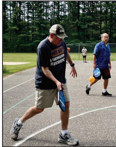
Come play pickleball 8:00-10:30 am at the Basketball court