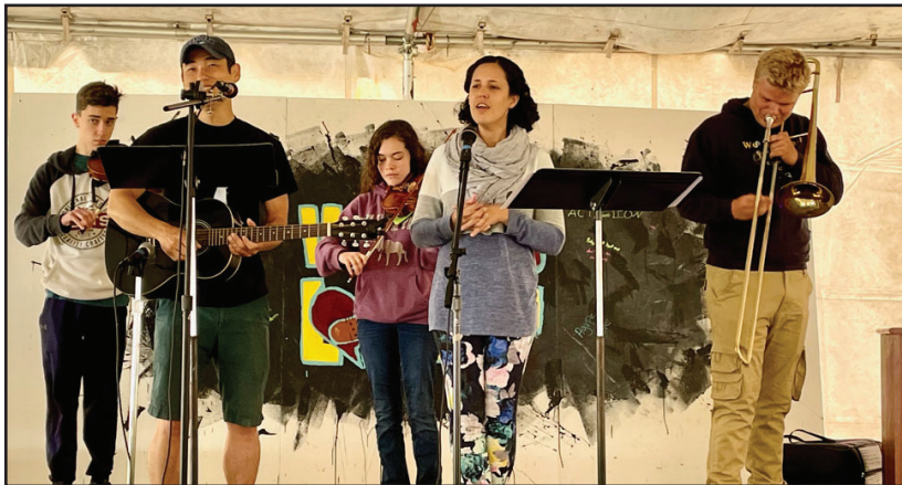
God has blessed the Youth division with a variety of musical gifts