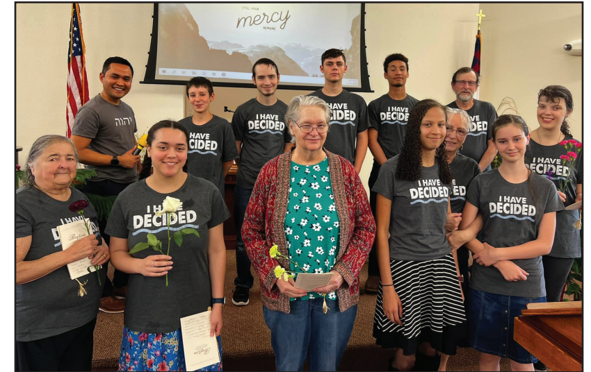
Two attendees of Prophecy Countdown joined 10 others in baptism at the Durand Church

Through the Durand Christian SDA Church Facebook page, we had at least 150 people watching with us during and after the program. In addition, some of our church members started sharing the videos for their friends to watch.