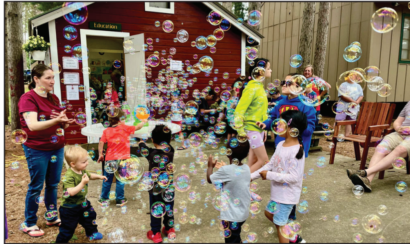
Bubbles bring squeals of delight outside The Little Red Schoolhouse