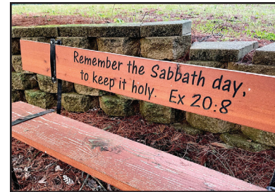
Bench in the Prayer Garden