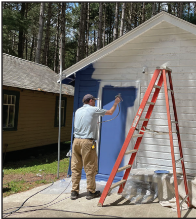
WA Cabin gets a make-over

PARENTS of Beginner and Kindergarten children: Please get ID wristbands from your division leaders to aid in the event your child becomes lost.