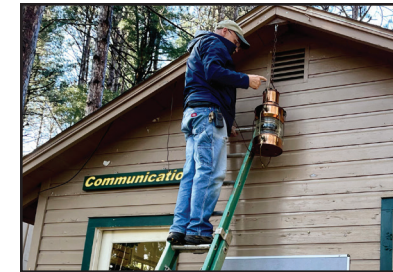
Hanging the Communication Lantern