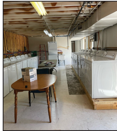
New Laundry Room in Cedar Lodge