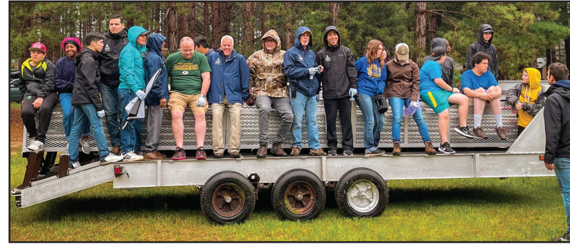
Pastors and camp staff working together in the rain