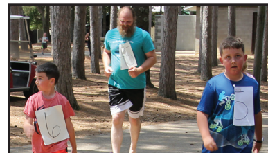
What a hot day!