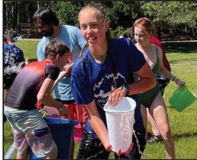
Who should I soak next?