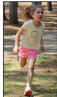
I can almost see the finish line!