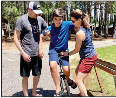
Unicycle class happening daily at 1 pm in front of Fireside Lodge