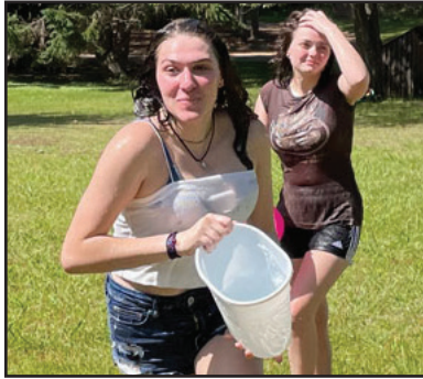
Are you ready to get wet?

The Teen and Youth divisions enjoyed spraying, splashing and drenching each other with buckets of water. And the Primary and Junior divisions took turns sliding down the slippery hill.