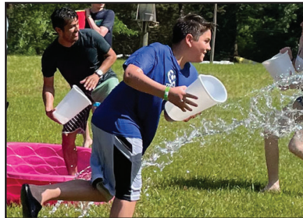
Almost got me