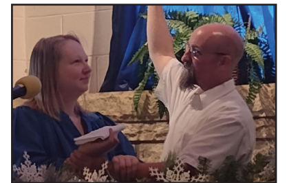
Kateri declaring her love for Jesus