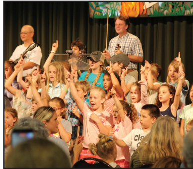
Primary singing God's praise in Pioneer Pavilion Thursday night