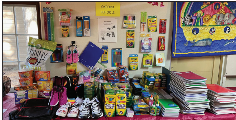
You gave 484 items and $300 for the Oxford Schools! Thank you, from Adventist Community Services, for your generous donations!