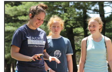
Enjoying the sunshine