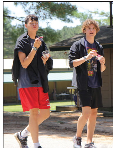
Cooling off with treats from the Snack Shack

Answers on back page of tomorrow's Camp Lamp.