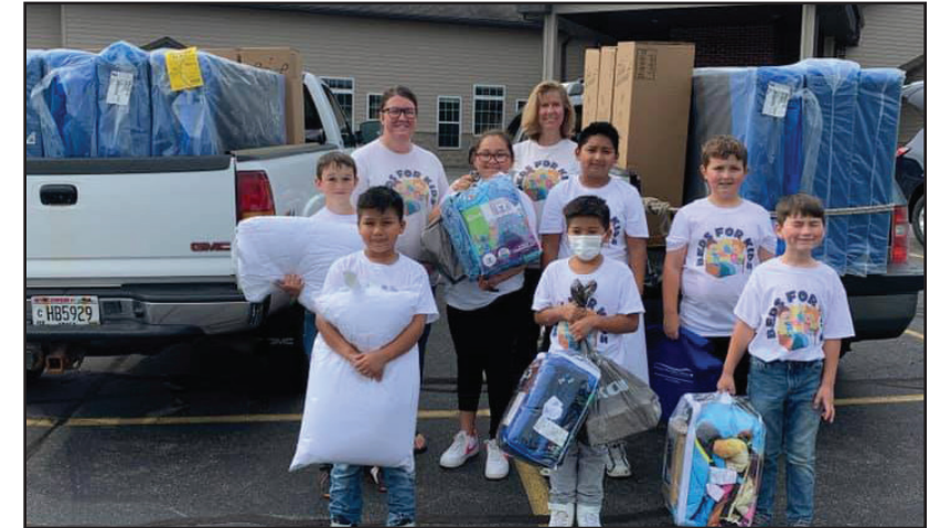
Members of the Shepherd's House Church with new beds to deliver

When this was discovered, an idea to let these kids know Jesus loves them was