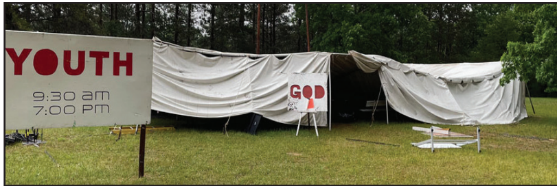
Praising God that no one was injured during the storms Wednesday evening!