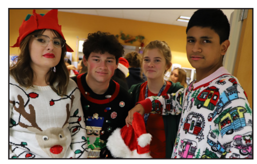
Students dress to represent a favorite season during SA Spirit Week. Theme days included, among others, Dress Like a Staff Member Day, Group Day, and State/Country Day.