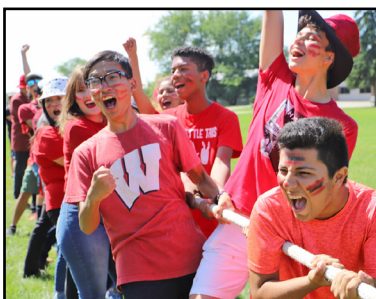
The junior class cheers in preparation for a game of tug-of-war with the seniors during our annual SA Fall Picnic. Games included a relay, steal the bacon stripple, soft-ball throw, donut eating, egg-toss, colony kickball, capture the flag, and more.