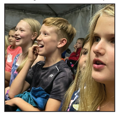
Excitement in Juniors