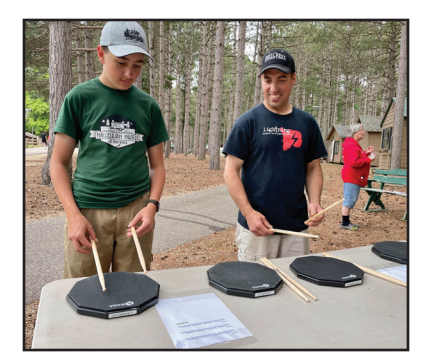
Practicing for Pathfinder Drum Corps