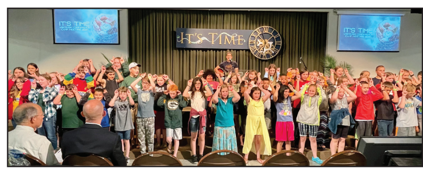
Juniors sharing songs for the evening program in Pioneer Pavilion