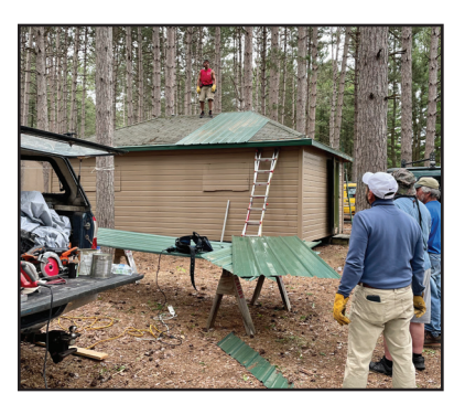
Thank You Volunteers! - New Cabin Roof