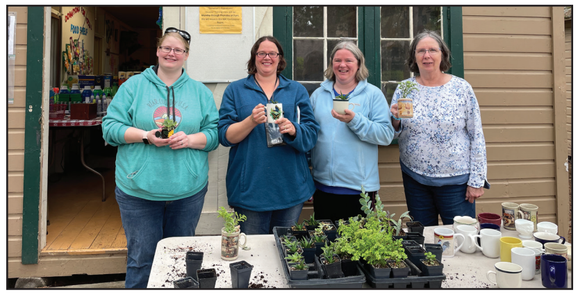
Making succulent planters at the Community Services Cabin