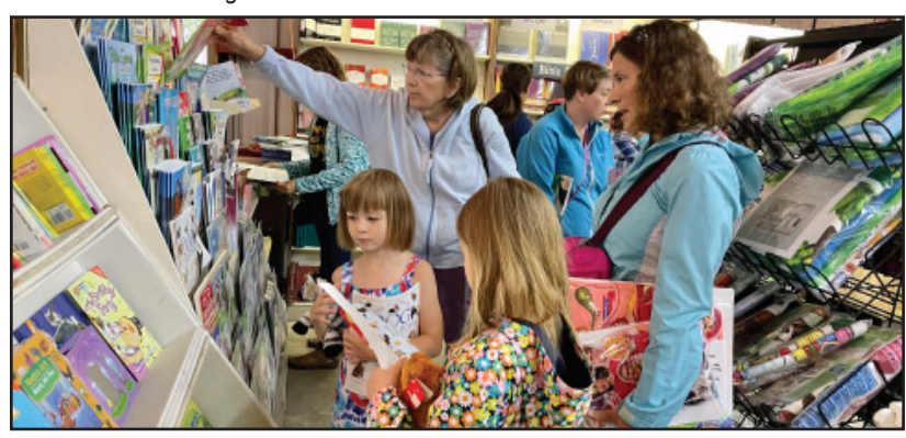
Exploring the many great finds at the ABC