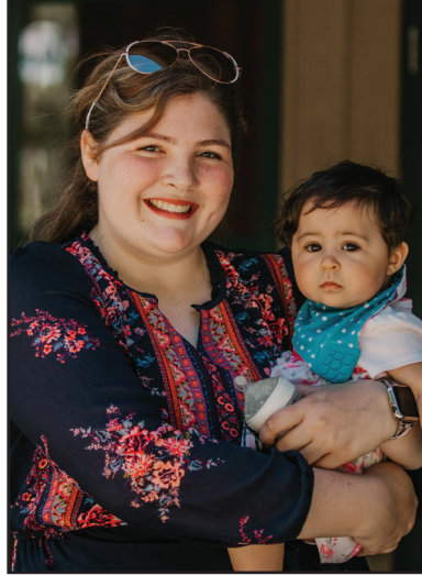
Spreading joy with a smile