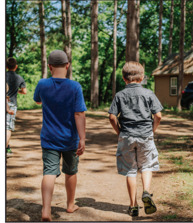
A walk with a friend