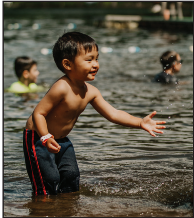
Fun at the water front