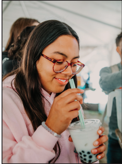
Sweet treat in the Teen tent