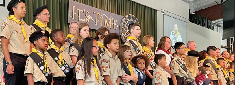
Wisconsin Pathfinders on the Pavilion stage Sabbath morning

Farmers in training and digging for worms