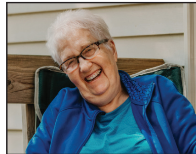
Smiles all around camp

1979 Holiday Rambler, 35 ft. Call Gloria 920-312-3471. Site #5336