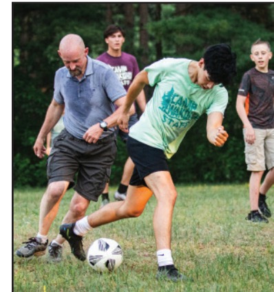
Pastor's and staff soccer game