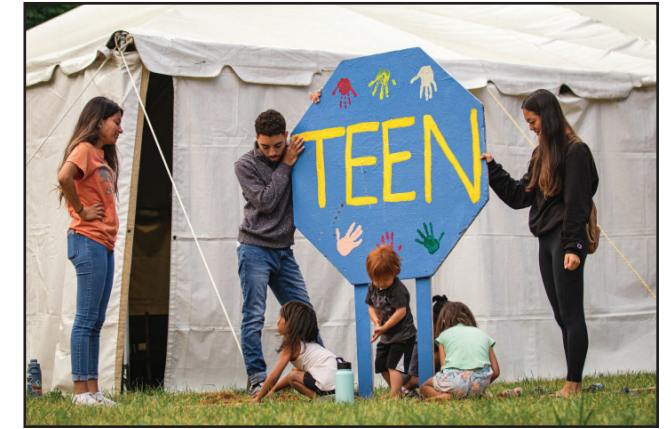
All ages helping in the Teen tent