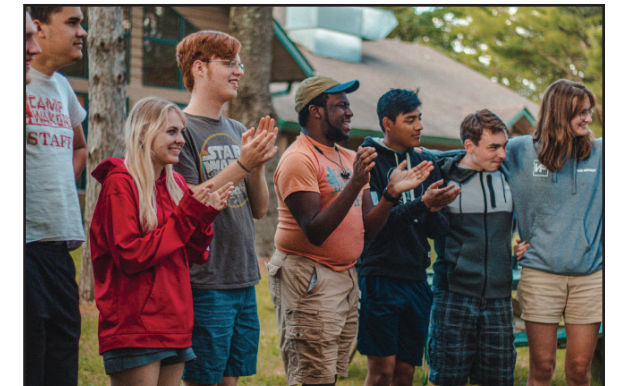
Camp staff ready for the day!