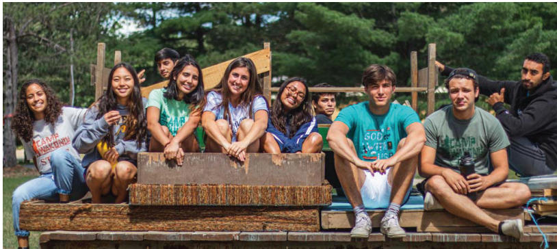
Tractor crew moving supplies to division tents