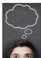
Ask Your Leaders President, Treasurer, Trust, Ministerial, Education, Youth, Communication