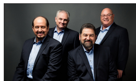
The King's Heralds Quartet

Register and learn more about camp meeting speakers, divisions, policies, classes, activities, and more on the conference website at wi.adventist.org .