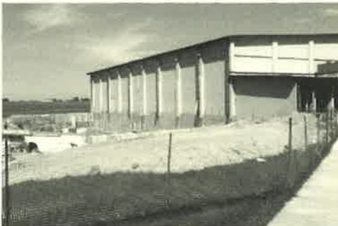
By September 6, block work is well under way with walls rising up