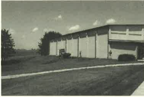
The dozer begins the first excavation on August 7, 2000