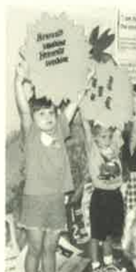
Songs in Hylandale