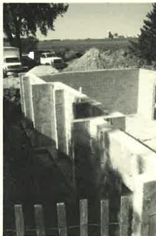
The South wall of the new complex as it appeared on August 25, September 6 and September 8 defines the rapid progress of the building

This project can be completed next spring with just $150,000 more in donations—Has the Lord blessed you with an abundance for just such a time as this?