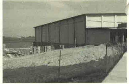
By August 25, footings are in place with foundational work