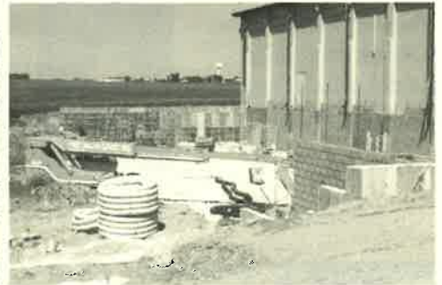
Construction materials abound as the walls rise