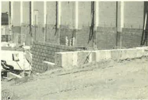
Block walls meet footings to define the future cafeteria