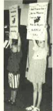
Happy in Jesus