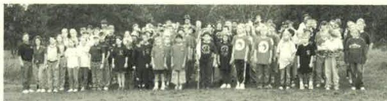
90 Pathfinders gathered for their fall camporee at Camp Go-Seek. Over 150 people were present for the weekend event!

The weekend is available to all women 18 years and older. The package price includes four meals, hotel accommodations and other retreat expenses. Registration begins at 3 PM on Friday; the retreat concludes at noon on Sunday. Applications are available at your local church or from the conference office.