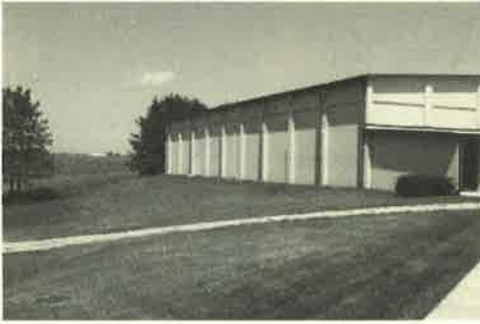
Our familiar gymnasium building before the bulldozer arrived