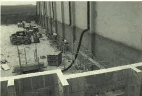
Roof drainage is maintained even while workers lay block walls