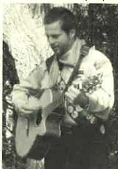
Sabbath Song Service—Motions are Good!