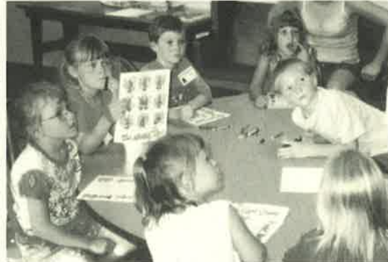
Children are captivated by a Bible story in Wausau