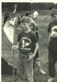
Morse Code the hard way