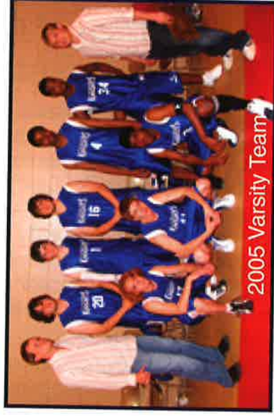
2005 Varsity Team