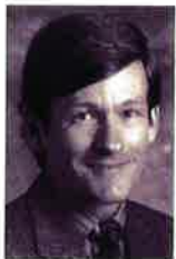
Roy Gane Adult Tent—11 am, M-F 2:15 pm in Young Adult Tent for Seminar