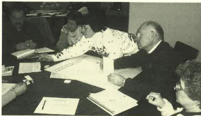
Energy & Ideas Flowed Quickly