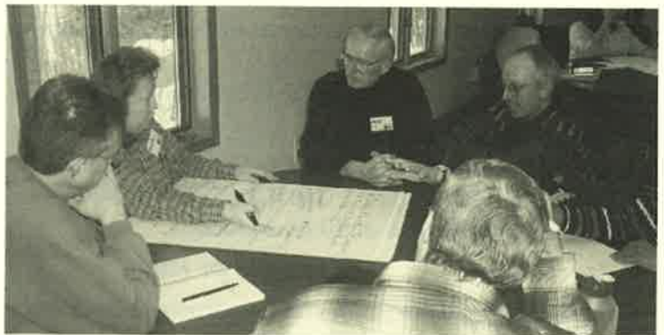
Groups worked hard to translate their goals into action plans

Many things could be done in education, but this group has set these as the items on which to concentrate for the near future. We encourage you to pray that Adventist education in WI. will continue to improve and develop.