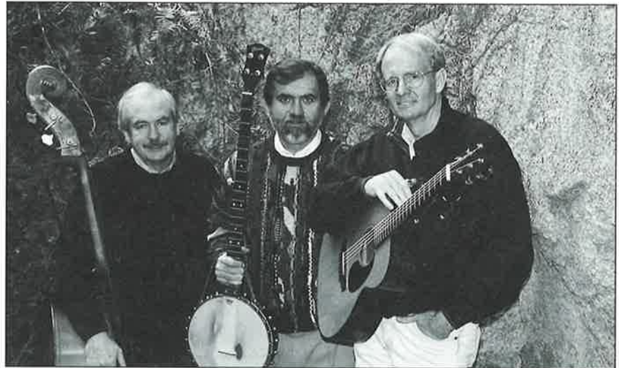
The Wedgwood Trio performs the first weekend.