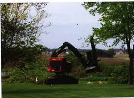
Heavy equipment prepares the way for the widening of Highway 151 on land formerly belonging to the Wisconsin Conference

We praise God that the State made what we believe to be a fair offer of $250,034.00 per acre for the land they took.