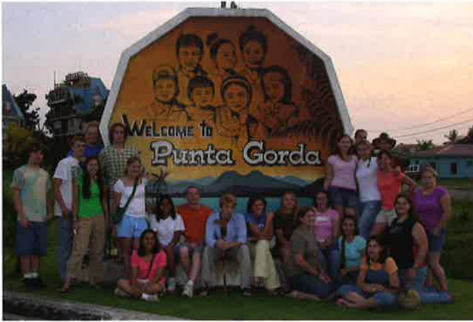
As our WA group arrives in Punta Gorda, the March weather and the welcome are both warm

After much anticipation, late nights and large amounts of procrastination, Wisconsin Academy's senior class of 2005, along with eleven adult sponsors, boarded a bus at 2 a.m. with high hopes of reaching Punta Gorda, Belize sometime the next day. As we left snowy, cold Wisconsin behind, we thanked God for the blessings of funding that He had already provided and prayed that we might be a blessing to the people we were about to meet.