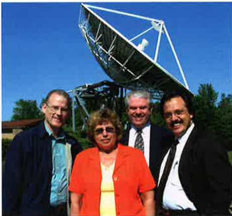
The Wisconsin delegation gathered beneath the original satellite dish that 3ABN first used to beam its signal around the world