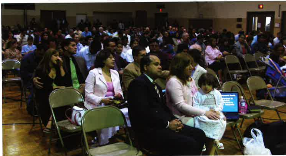
A large crowd gathered to worship, sing, fellowship and of course to eat