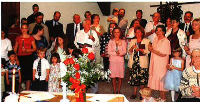
Charter Members of the Monroe Church rejoice at the inauguration of this new body of Christ

gift of a beautiful communion set and a home communion set for serving the church family and a challenge to share the light of the gospel with their neighbors and friends.