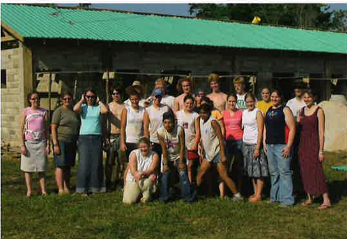
The WA Building crew takes time for a group picture