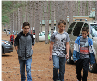
On the way to another camp meeting event!