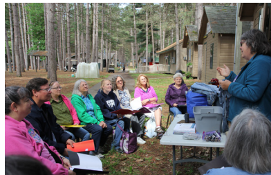
Join a Community Services Class at the ACS Cabin