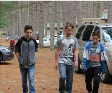
On the way to another camp meeting event!

Behind his eyes, before his ears Solomon's two were found/ He had a third one, a different kind Built on Ornan's mound