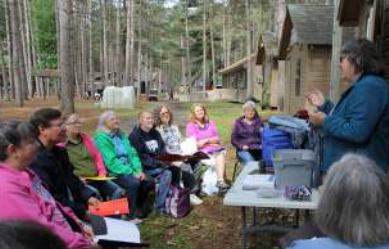
Join a Community Services Class at the ACS Cabin