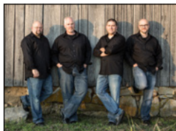
The Emmanuel Quartet