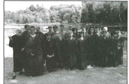
A lakeside baptism of 22 people highlighted the close of Wisconsin Camp Meeting.