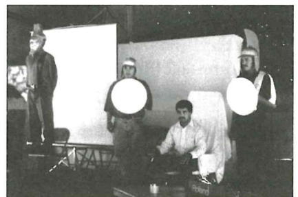
The Youth Society practices a skit for the Hispanic Camp Meeting, held in August.