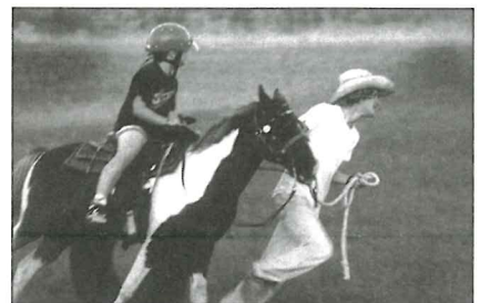
"Horses!" was voted the favorite activity among some campers this summer at Camp Wakonda. Many non-Adventists attended.