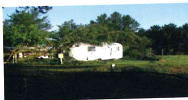
Trailer that suffered damage from falling trees.

The strong swirling winds knocked out electricity for 9.5 hours, and blew over several trees. The good news is that few were at camp and there were no injuries. Four