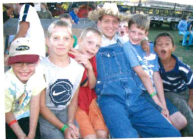
Happy campers at Wakonda