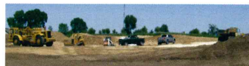
Site of the new Conference Office located in Fall River, Wisconsin.