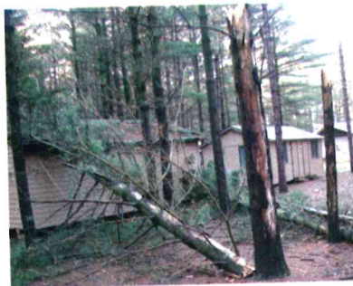
This cabin suffered minor damage from falling trees

Around midnight Saturday night, August 11, the wind picked up.