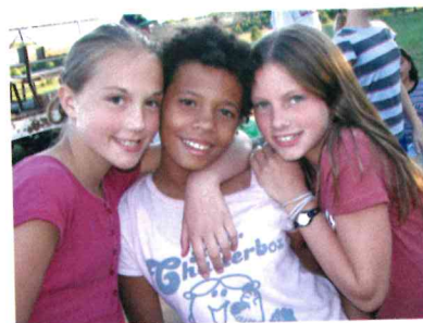
Making friends during Junior Camp