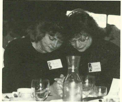
A weekend of women ministering to women

October 27-29, 2000 is the time for the 12 th annual retreat.