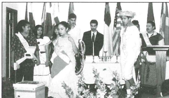
Young people in costumes from Mexico and Puerto Rico and other Spanish speaking countries with their flags at the Spanish Youth Federation inauguration.

On January 31 the Hispanic Youth Federation met for their inauguration program at the Milwaukee Central Spanish Church. The Federation includes young people from all the Hispanic churches and companies in Wisconsin. A procession of flags and youth dressed in the costume of their country was the highlight of the program. At the end of the program each of the youth were asked to serve Jesus in the church and their communities.