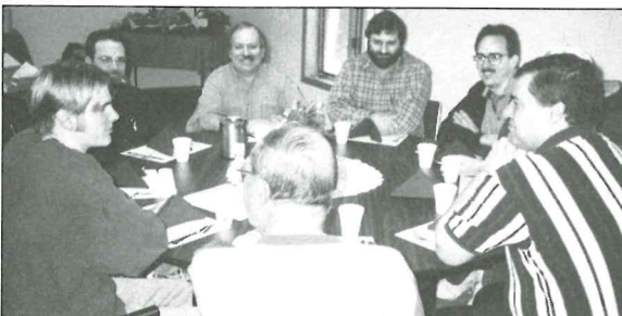
Candlelight meals with friends old and new bridged generations and state lines to bring men together.