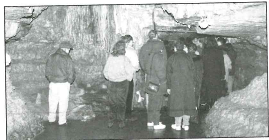
Pastors and Teachers enjoying a field trip to the Cave of the Mounds.

They will conduct meetings in the city of Nizhny Novgorod and dedicate a church building that was built three years ago while they were there. The McClintock's say they need sound equipment for their meetings and funds to continue building new churches. You can send a tax deductible donation to the Clear Lake Church at 76 20 th Ave., Clear Lake, WI 54005. Please make sure donations are marked for Russian Evangelism.