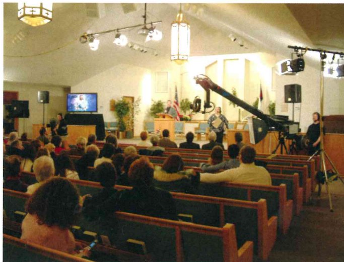
The Madison East Church was transformed into a 3ABN television studio for the weekend of January 6