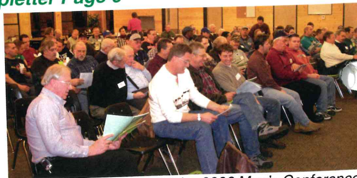
Over 100 men attended the 2006 Men's Conference