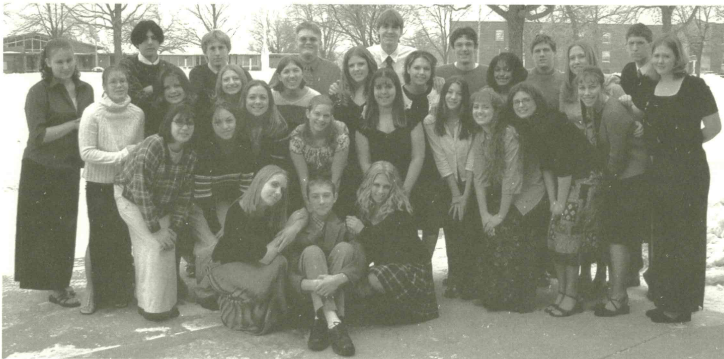
The Wisconsin Academy Class of 2003 has set high goals for spirituality, academics and service. A case in point—they are going on a mission outing to Africa for their class trip.

Put on your flipflops—grab some sunscreen. Oh, and don't forget the mosquito net! None of us could have ever have imagined that this dream would become a reality.