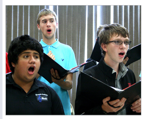
Like • Comment • Share