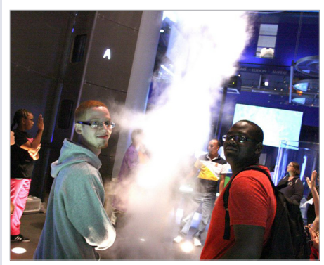
Like • Comment • Share

WA visited the Museum of Science and Industry in Chicago today, including the WWII U-505 German submarine exhibit.