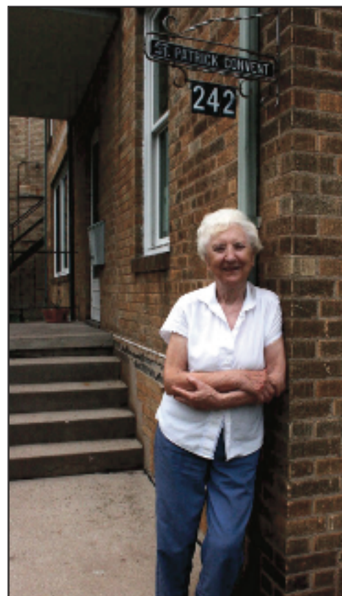
Even till the time of your grey hair, I am with you. Isaiah 46:4 “I love this promise!”