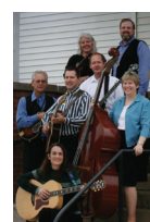
True North 1st Sabbath Afternoon Concert Dates: Sabbath, June 18